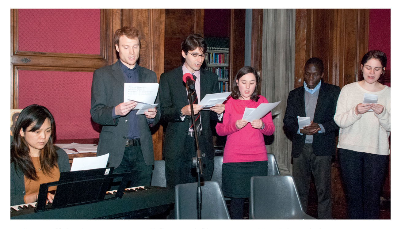
Chorus ensemble, from the Lay Centre in Rome, sung for the Ecumenical Celebration in occasion of the Week of Prayer for Christian Unity

The vocation is then renewed in God's people through the cross and resurrection and by the Spirit. It is striking that in Revelation when, three times, we are told what was achieved through the death of Jesus. it is expressed not in terms of 'going to heaven' or 'being with God for ever' but in terms of the royal priesthood. The church as the people of God is the church discovering, with difficulty because of many distortions over the years, what it means to share in the divine rule over the world. We don't like 'theocracy', because to us it sounds like mad clerics with a hot line to heaven forcing brutal regulations on unwilling people. With Jesus it's different, to say the least. In the four gospels this kingdom is inaugurated precisely through the Messiah's crucifixion; when James and John look for normal worldly power at Jesus' right and left hands, they are hoping to be the agents of that sort of theocracy, but they