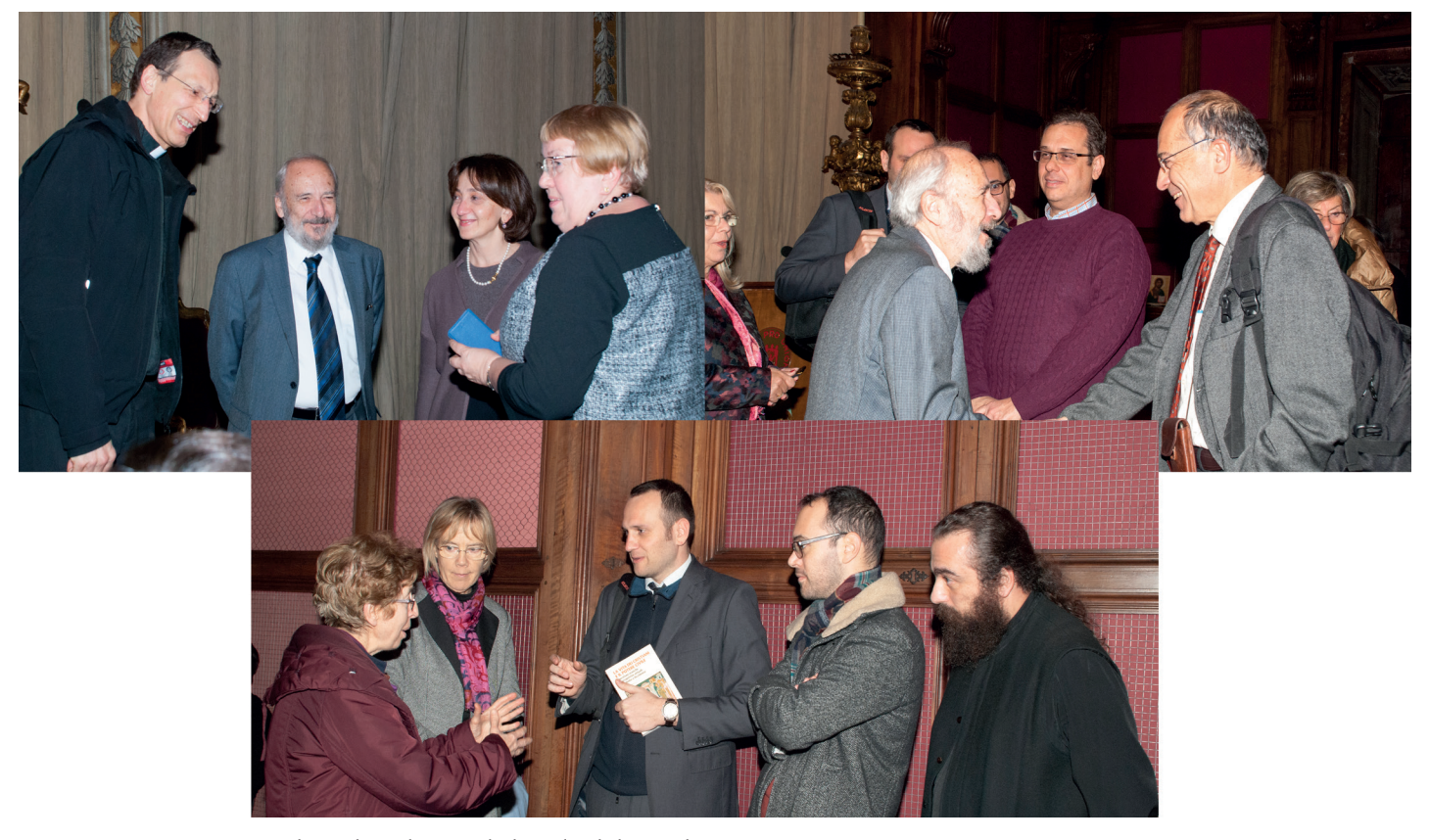
The speaker and some Orthodox and Catholic attendees

with some improvements will be submitted to the Synod. They all address problems that emerge from adapting an ancient faith to a modern reality, like precepts of fasting, regulations of marriage, and most importantly issues of sensitive nature, like the relations of the Orthodox Church with the other Churches and Christian confessions, the witness of the Orthodox Church to the contemporary world, and hopefully non-canonical governance issues facing the Orthodox Church in the Orthodox diaspora.