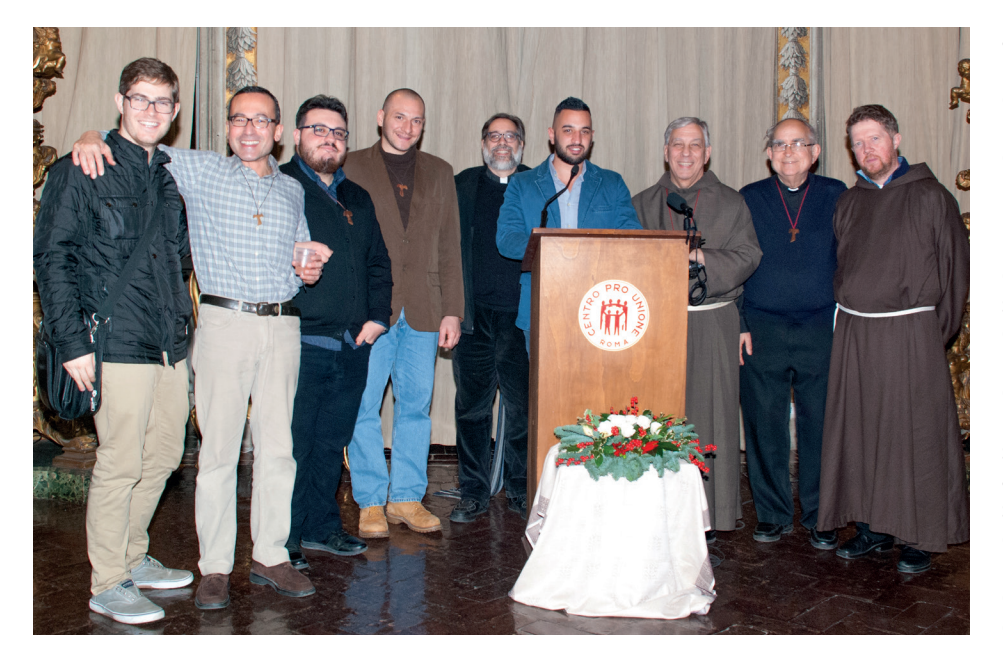
> The Friars of the Atonement with candidates and friends

parlance, it reflects the routinization of all religious movements. This is the mode in religious systems with centralized authority, a mode of