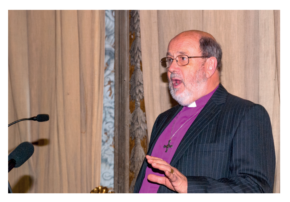
Rt Revd Prof N T Wright DD

My theme this evening – The Church as the People of God – might sound bland and obvious. In systematic treatments the phrase 'the people of God' is sometimes listed as one facet of the church, in parallel as it were with others, like 'the new Temple' or 'the Body of Christ'. I suspect that many of those who have used the phrase 'the people of God' since Vatican II, and engaging with its arguments, have done that; in some ways I might have used this lecture to reflect on Vatican II in the light of subsequent developments, but that isn't the sort of thing Anglicans characteristically do and I thought it better to