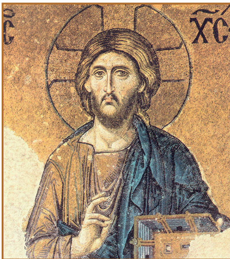
Presentazione, particolare del mosaico della Basilica di Santa Sofia, Istanbul

SETTIMANA DI PREGHIERA PER L'UNITÀ DEI CRISTIANI 18-25 gennaio 2019