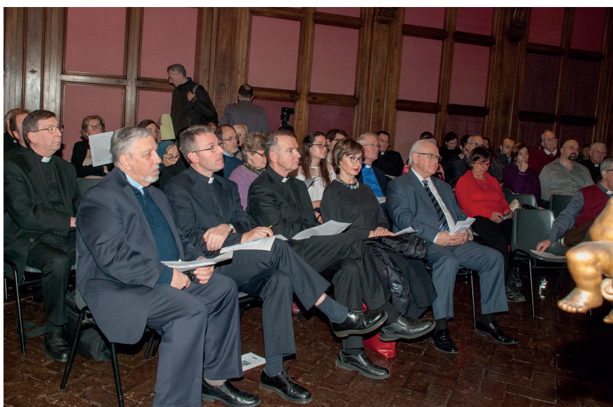
► The hall during the conference

The two leaders met again in May 2014 in Jerusalem, commemorating fifty years since the meeting there of Pope Paul and Patriarch Athenagoras, and then once again in November 2014, when Pope Francis visited Constantinople for the feast of St Andrew. In Constantinople, Pope Francis made a most important statement, reiterating exactly some of the key decisions of Vatican II, which have really changed the whole framework for Catholic-Orthodox relations. He said that 'the restoration of full communion does not signify the submission of one to the other, or assimilation', and he then said, very simply and clearly: