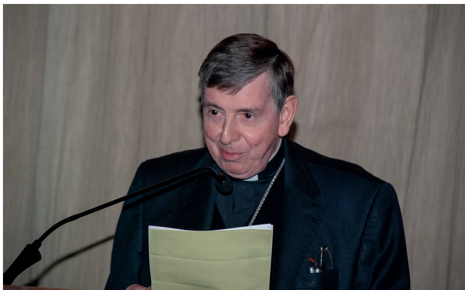
Kurt Cardinale Koch

teologiche, ma anche forme e sviluppi culturali differenti. Questo risulta particolarmente evidente nel caso della divisione nella Chiesa tra Oriente ed Occidente. Di fatti, nel mondo cristiano occidentale e orientale, il Vangelo venne recepito sin dall'inizio in modo diverso e fu vissuto e trasmesso in diverse tradizioni e forme culturali. Le comunità cristiane orientali ed occidentali convissero con queste differenze all'interno della