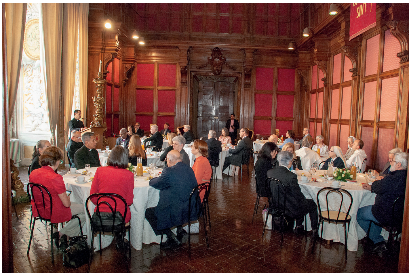
► Un momento della cerimonia 'un tè ecumenico' avuto luogo per celebrare il 50° anniversario di fondazione del Centro Pro Unione, 1968-2018 "Come 50 anni fa"