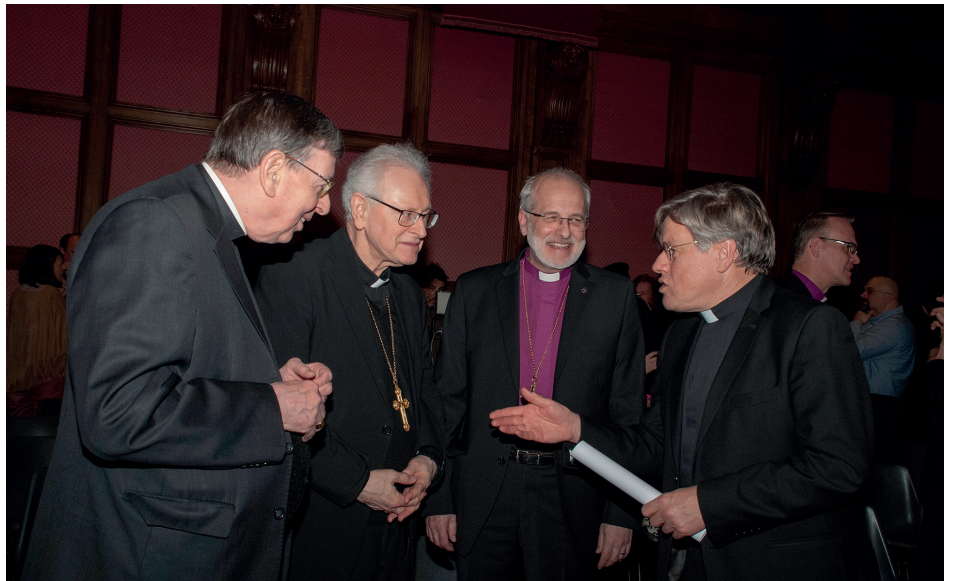
► HE Kurt Cardinal Koch talks to some participants at the Conference

What I have tried to do here, in a very schematic and brief way, is to outline elements that have come from 50 years of dialogue and enable us to write a new