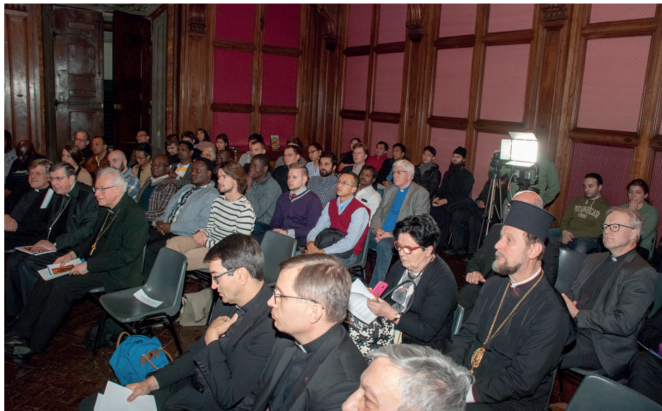
Some of the participants at the conference

What then are some of those elements of ministry that both Lutherans and Catholics are in agreement? Without going into great detail here because of time, it will be sufficient to list some of the aspects of common agreement. First, "ministry in the Church means the special ordained ministry in the service of the salvific ministry of Christ, and secondly, the actualisation of the salvific ministry of Christ on the basis of Baptism and confirmation that is the priesthood of all believers (1 Pet. 2:5,9; Rev. 1:6). The existence of a special ministry is constitutive of the Church" (§194). This means that ministry belongs to the essential elements that express the church's apostolic character and through the power of the Holy Spirit to the church's continuing apostolic faithfulness. 28 Ministry in the Church as a whole is subordinated to the one ministry of Jesus Christ. This common priesthood and the special,