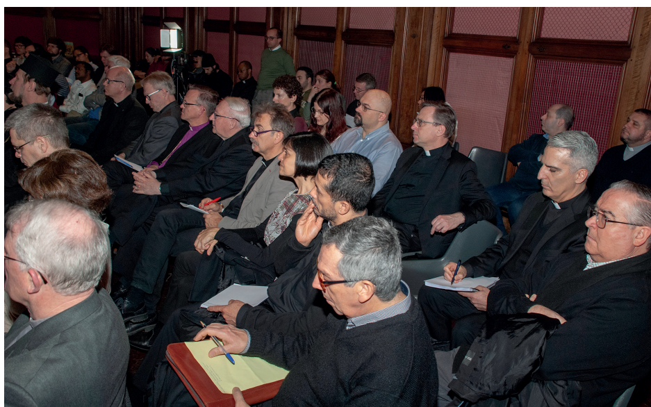
▶ A view of the hall during the lecture