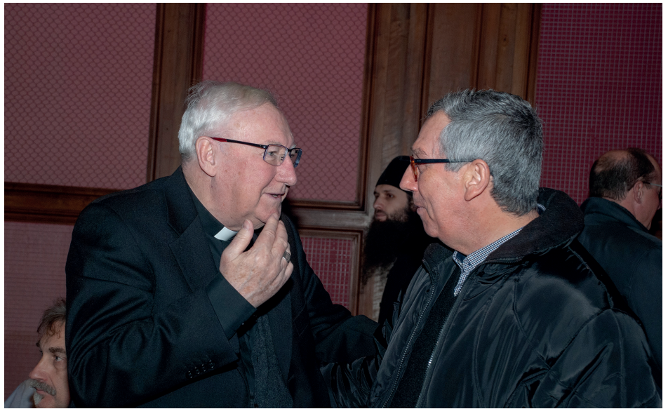
► Bishop Brian Farrell, Secretary of the Pontifical Council for Promoting Christian Unity

Because the Church shares in the Trinitarian life, she is therefore a communion ( koinonia ) on earth sharing in God's gifts offered by Christ. Because of the recovery of the biblical notion of koinonia all churches and ecclesial communities have been able to recognize more fully the role of the church on earth. This fact has been amply illustrated in the US Lutheran/Catholic dialogue statement The Church as Koinonia of Salvation: Its Structures and Ministries 12 . An important realization is the recognition that the Church is not only a spiritual reality but a visible one as well which means that the Church can be seen where an assembly has the visible marks of word, confession and sacraments 13 . I believe that in this we see a profound continuity with our Jewish brothers