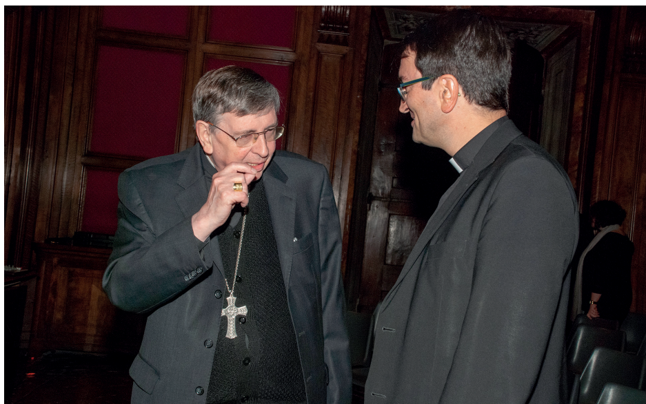
▶ Kurt Cardinal Koch during the lecture

Our own Pontifical Council for Promoting Christian Unity has also enjoyed a long and fruitful collaboration with the Finnish Evangelical Lutheran Church. Already